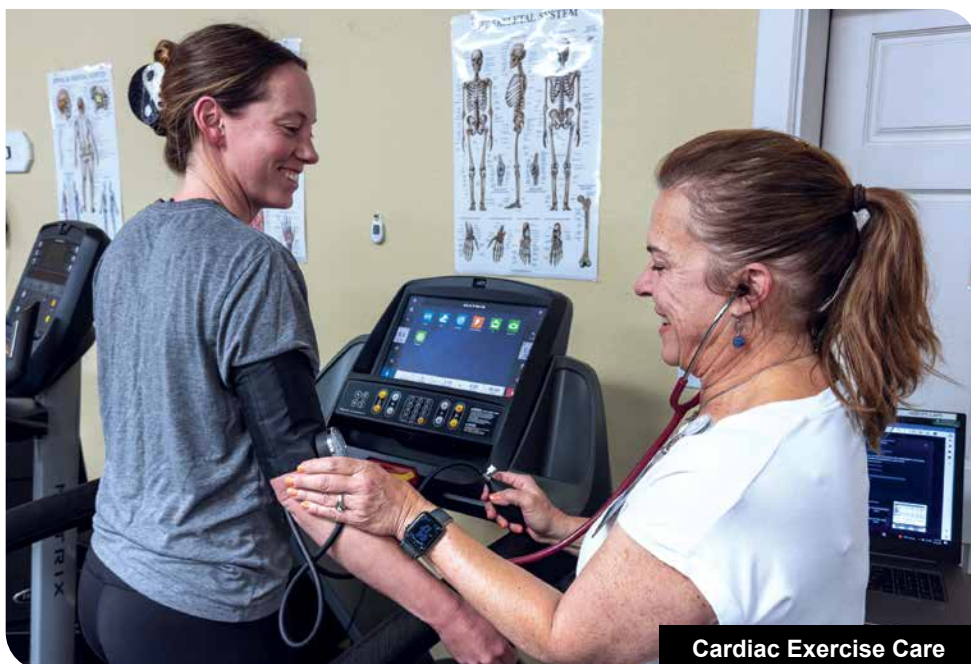
Cardiac Exercise Care

A typical cardiac rehabilitation program consists of nutritional counseling, weight and diabetes